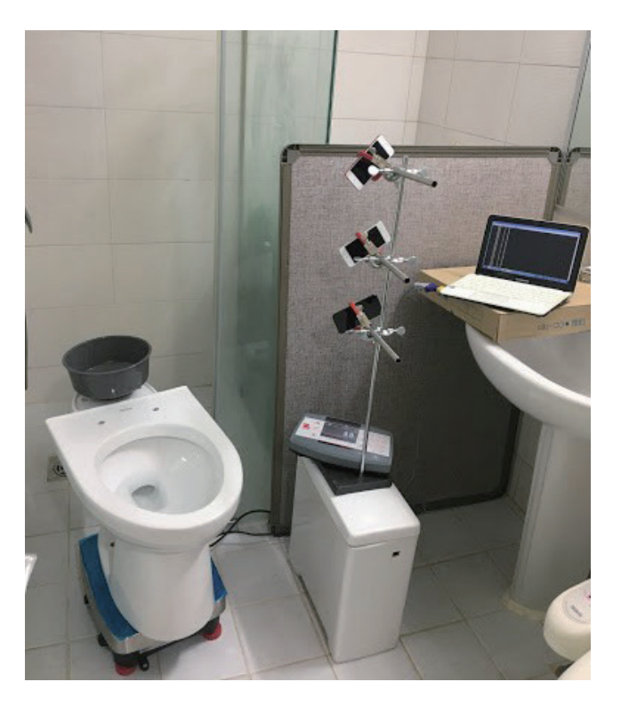
Fig. 2. A laboratory setting to measure the urinary flow while recording urination sound.